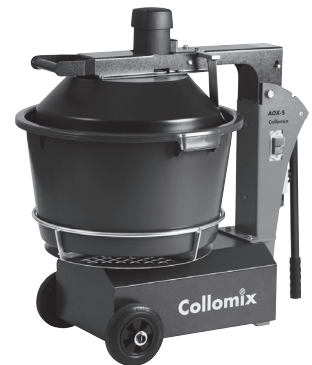
The AOX when closed