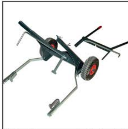
Tighten the upper part with the 4 wing nuts. Pay attention that the axle bar is correctly fitted through the cuttings.