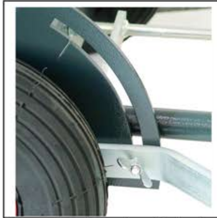
Unscrew the wing nuts and bring the right and left arm in maximum position, and tighten the wing nuts again.