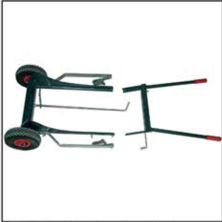
Set the trolley down lengthwise on the floor, for positioning of the arms