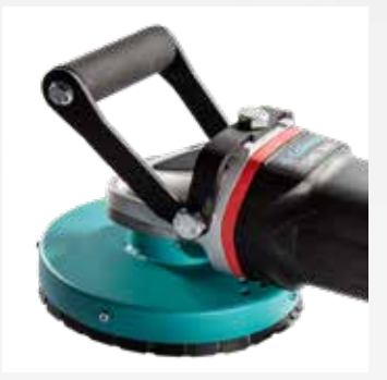
Comfortable grip for an optimum hold and safe grinding