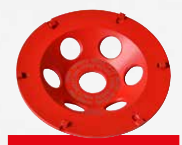
PST 125 Strap-it