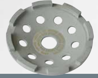
UST 125 Universal