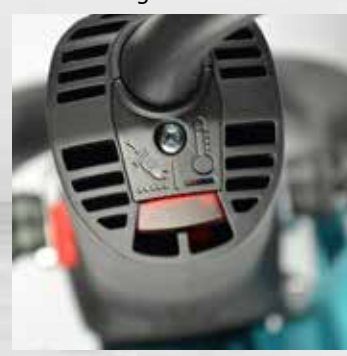
Visual performance monitoring as overload protection