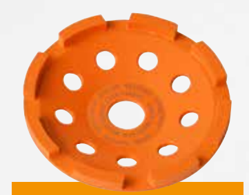
GST 125 Grinder