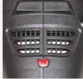
Visual performance monitoring as overload protection