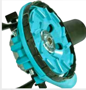
Closed lamellar ring for lowdust working*