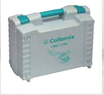
Robust case for safe and practical stowage