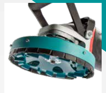
Closed lamellar ring for lowdust working*