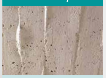
For hard substrates: for rough grinding